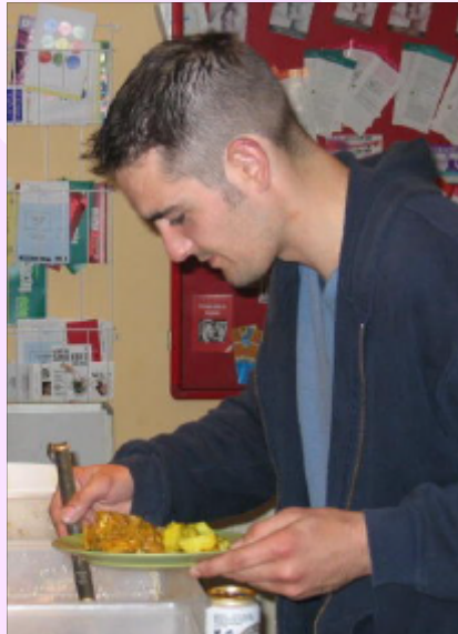
The best food I have ever eaten in my life

there any businessman in the whole world within ten years with forty rupees he can increase forty crores ? There is no example. And ten thousand men, they are eating prasadam daily. So this is Krishna consciousness. Yoga-ksemam vahamy aham [Bg. 9.22]. As soon as you become Krishna conscious, you simply depend on Him and work sincerely and