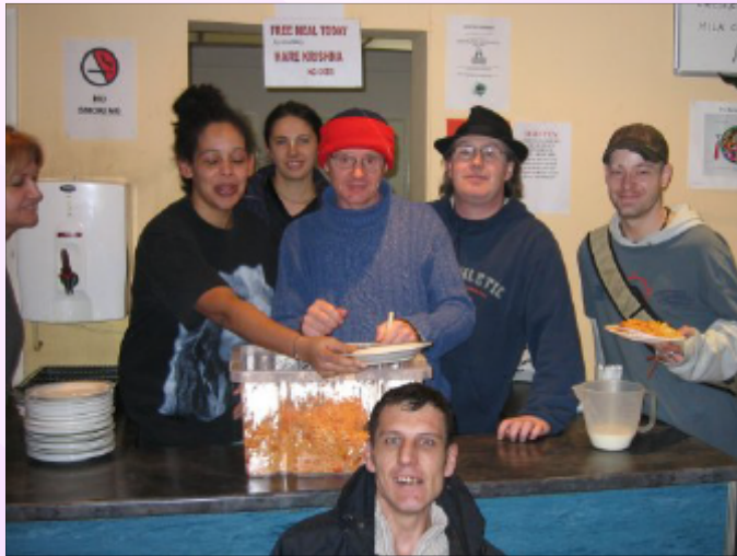
Devotees with the Anchor Club staff and some happy prasadam eaters

"If you eat bhagavat-prasadam , then gradually you become spiritualized; it has this potency. Therefore it is said that realization of God begins with the tongue. Sevonmukhe hi jhivadau : [Brs. 1.2.234] If you engage your tongue in the service of the Lord, then you realize God. So what is that engage-