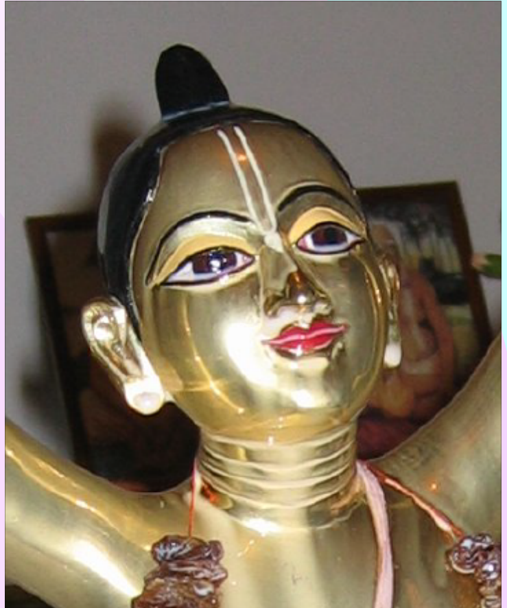
Lord Nityananda, the original spiritual master and savior of the most fallen

The Lords wanted to make Their grand appearance. They didn't care about formalities, time or place or any institutional policies. They wanted to come and give Their most beneficial darshan to all the people of Leicester and beyond.