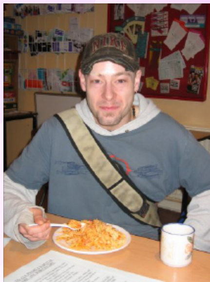
Food for the body, mind and soul