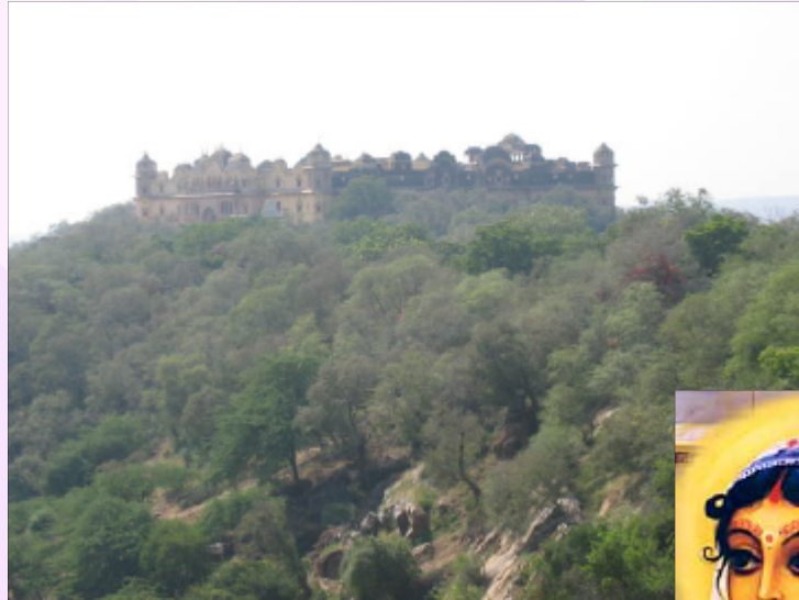
Varsana, the abode of Srimati Radhika