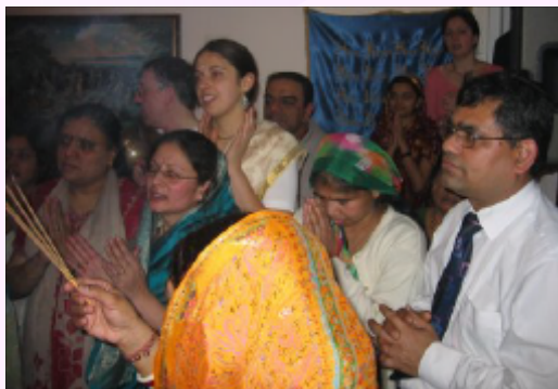
The temple room filled with devotees from throughout the UK

It is tradition to offer at least 108 bhoga preparations to the Lords for Their appearance. Devotees from all quarters came forward to cook for the