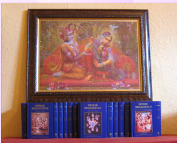
Srimad Bhagavatam set of 30 volumes

Gauranga Sundara Prabhu distributed over 20 sets of Srimad Bhagavatams and Bhakta Jimmy distributed over 1,000 'Back to Godhead' magazines.