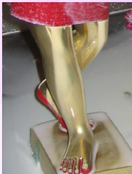
The merciful lotus feet of Lord Nityananda