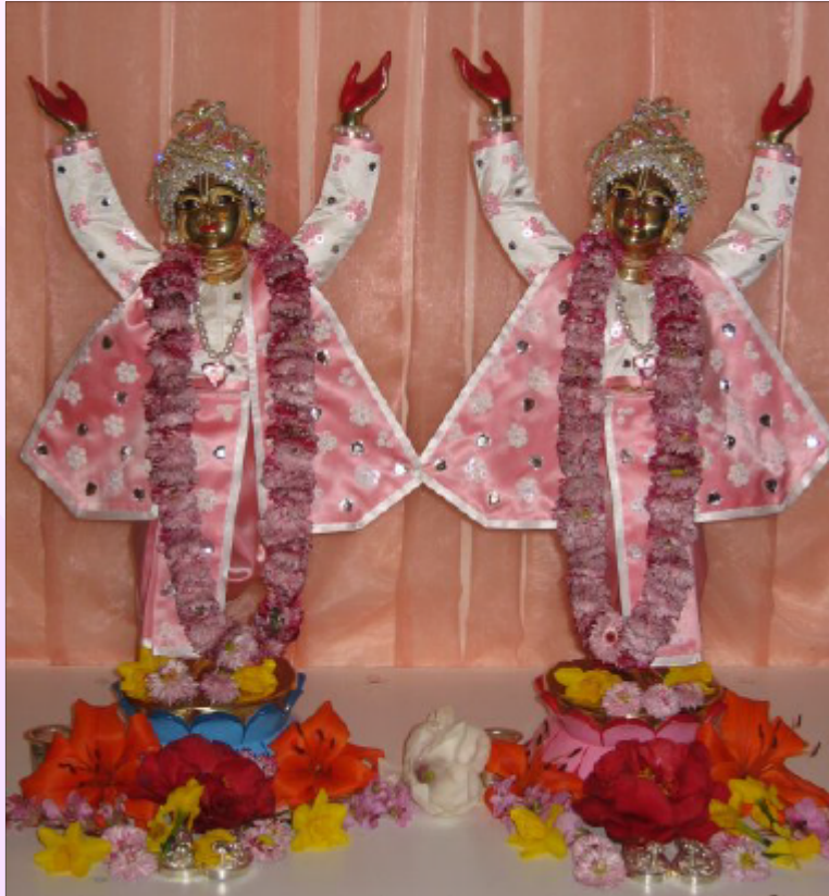
Sri Sri Nitai Saci-Sundar, the most beautiful Lords at the Hare Krishna Centre in Leicester