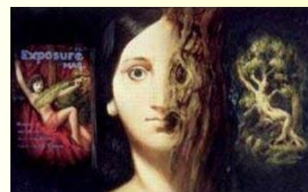
Become a Tree