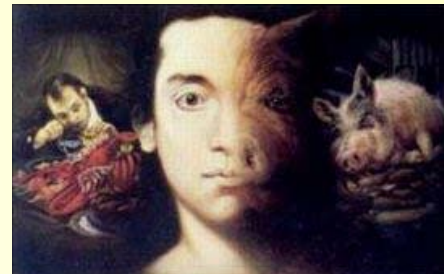
You Are What you Eat

(47) Karma for one embodied begins with the body that one acquired as a consequence of the way one acted; by that karma one expands to another body and the both of them one indeed owes to one's ignorance. (48) Therefore does all the regulation of one's income and desires for sense gratification as well as the religion thereto depend upon the glorification of the Soul to the soul, the Lord divinely indifferent who is the Controller [of Time and karma]. (49) Of all living beings He is for sure the Lord, the original source, the one pulling the strings, the Beloved, who by His separate energies has created them as the Individual Soul of all individual entities together. (50) Whether god or demon, man or ghost or a singer of heaven indeed, rendering service at Mukunda's feet do we all become just as fulfilled with all of His!