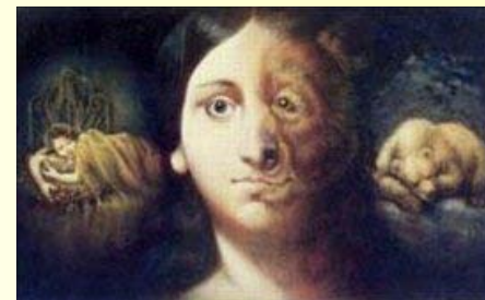
Want to be a Bear?