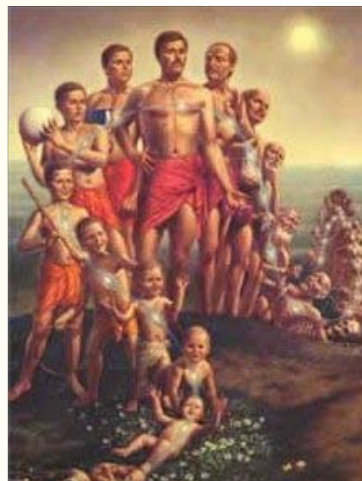
The Cycle of Birth and Death

The reason why some good people suffer all their life is because although they are now good. They still suffer because they