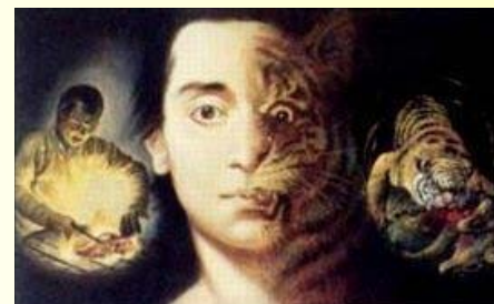
Be a Tiger