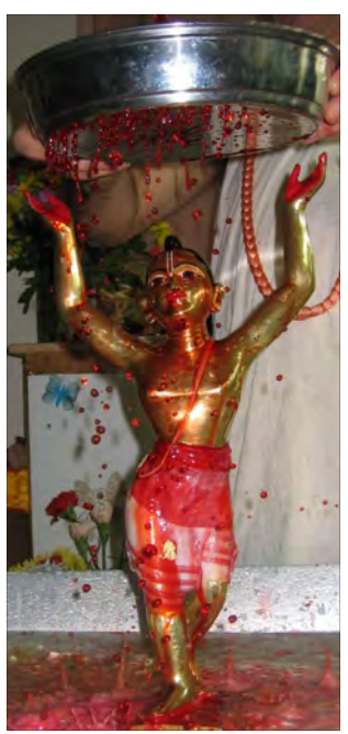
The abhisheka bathing ceremony