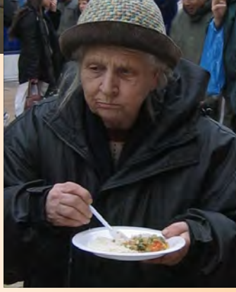
God bless you for your kindness!

Krishna prasadam, which consists of rice, subji (vegetable mix), cake and a drink costs 50 Pence only. Anyone who wants to sponsor 50, 100 or more plates of prasadam is advised to get in touch with the Hare Krishna Centre for a sponsorship form.