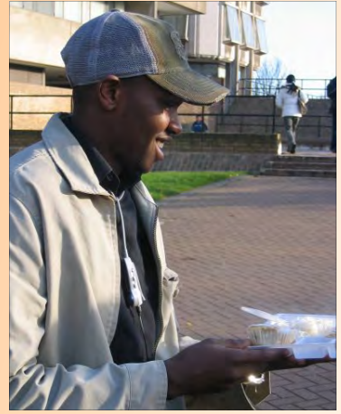
Hey man, is that really free?

Students are pretty poor financially these days. Many leave university with about £15,000 in debts due to educational fees. They are very happy to get a healthy, free and nutritious meal. Because it is vegetarian it is suitable for Jews, Muslims, meat eaters and