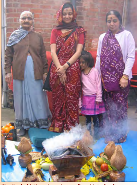
The final oblations have been offered into the fire