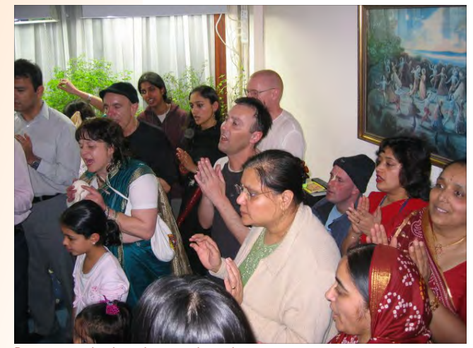
Devotees enthusiasm knew no bounds

After the bathing it was time to offer the multi-course feast. It took time to bring in the various dishes devotees had prepared with much love and devotion. It was a beautiful sight to see such