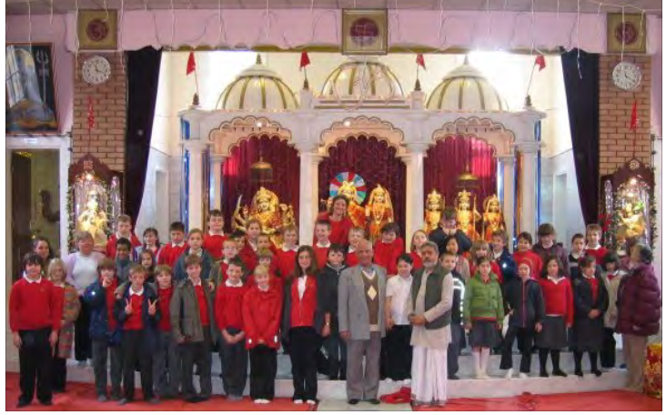
English Martyrs Catholic Primary School at the Geeta Bhavan

Jewish tradition and Islam and were now looking forward to learn something about the Hindu