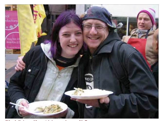
Ilt's delicious, it's nutricious, why say No?