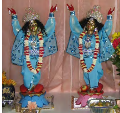
Their Lordships in Their new outfit

The festival ended with devotees breaking their fast and respecting the remnants of food offered to the Lords called maha prasadam (great mercy), which is so potent that it is capable to deliver even the greatest of wrongdoers