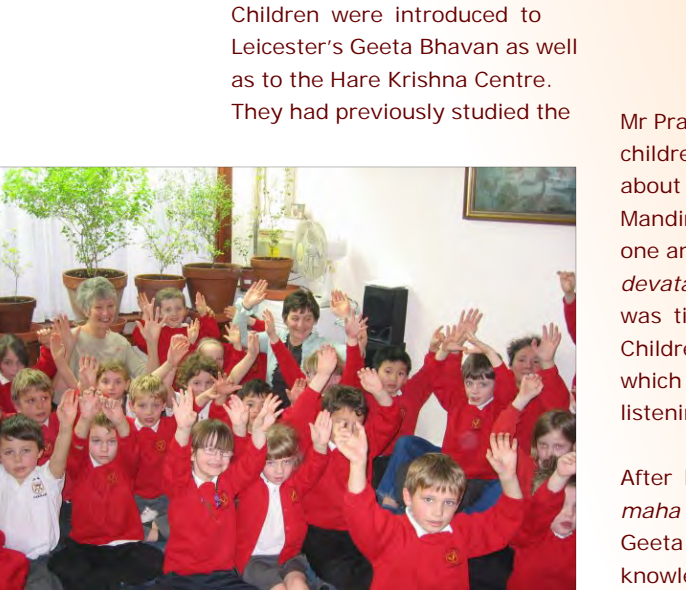
Children and teachers chant at the Hare Krishna Centre

arch saw a visit of 'English Martyrs' Catholic Primary School' to the Hare Krishna Centre. Two groups of children from key stage one and key stage two were eager to learn something about Hinduism.