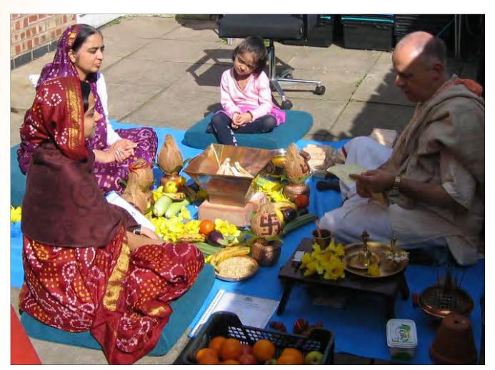
Chanting mantras before the yajna

"In the beginning of creation, the Lord of all creatures sent forth generations of men and demigods, along with sacrifices for Visnu, and blessed them by saying, "Be thou happy by this yajna [sacrifice] because its performance will bestow upon you everything desirable for