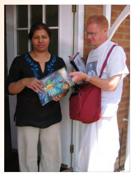
A Back to Godhead magazine in every street and house

"... every member of the Krishna consciousness movement is interested in going door to door