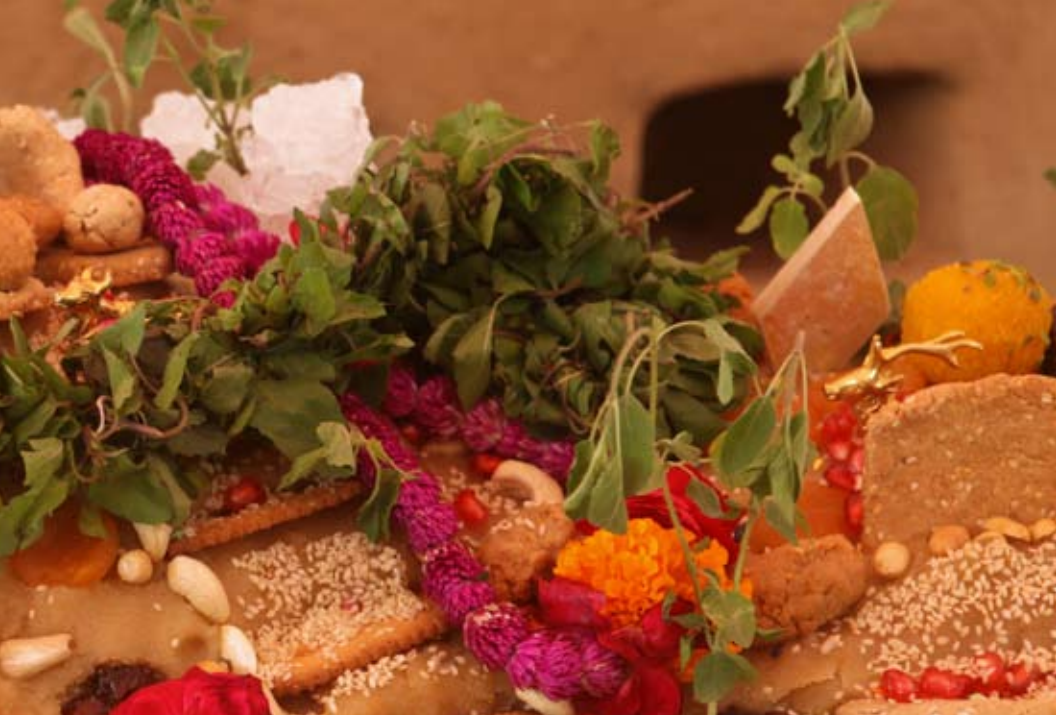
sweets, sesame seeds and fresh fruits. A sacred stone from Govardhana Hill rests atop.