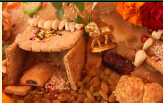
A cave made of wafers and cookies