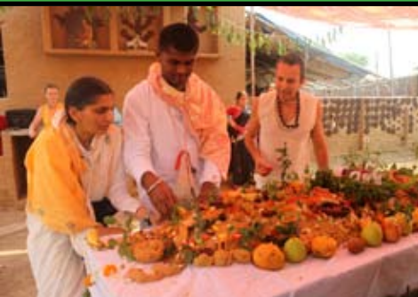
Devotees make the final touches