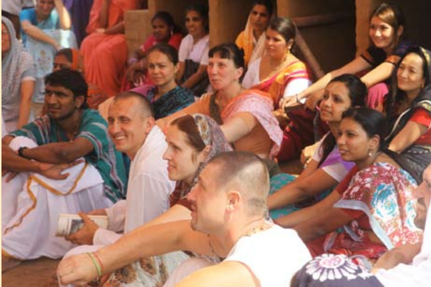
a captive audience on the importance of cow protection.