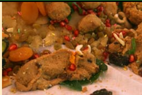
Cows made of burfi

As the water started to rise the Vrajabasis desperately appealed to Krsna to save them from drowning. The cows also had no place to sit and to appease them all Krsna lifted Govardhana Hill and balanced it on the little finger of His left hand creating a giant umbrella to shelter the distressed cowherds and cows.