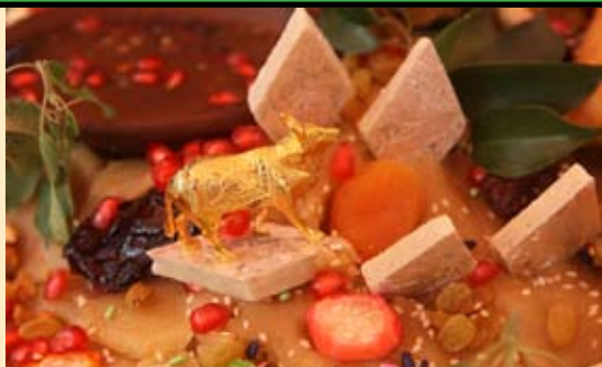
A golden cow amidst pomegranate seeds

The Tenth Canto of Srimad-Bhagavatam describes how Krsna once convinced His father Nanda Maharaja to abandon the traditional worship of Indra the rain-god and instead worship Govardhana Hill. Krsna argued that since Govardhana Hill provided all necessities to their cows, and since the cows