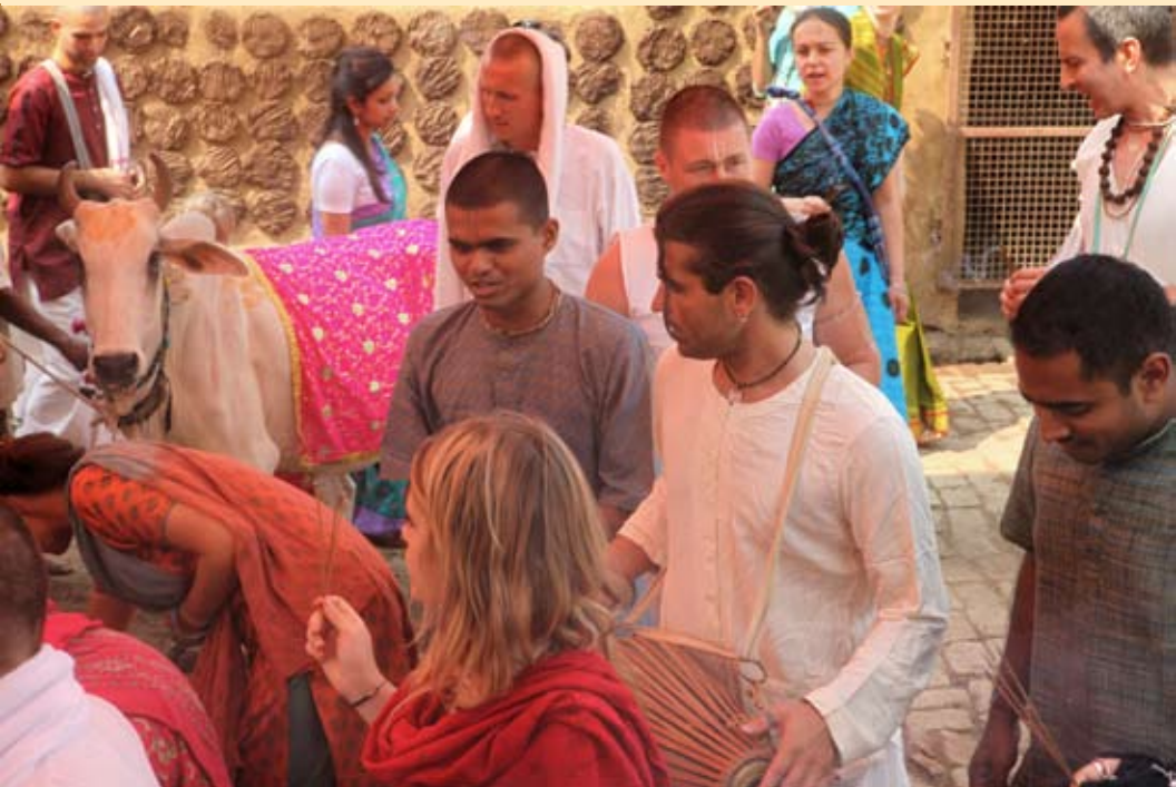
Guests circumambulate Priya while offering her incense

Kṛṣṇa tells Uddhava: "I can be worshiped within the cows by offerings of grass and other suitable grains and paraphernalia for the pleasure and health of the cows." (S.B. 11.11.43)