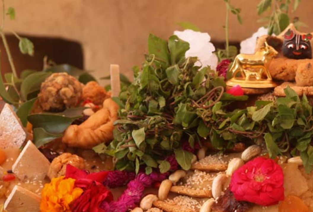
Above: A hill made of rice and halava, dried fruits, nuts, flowers, tulasi leaves, milk s